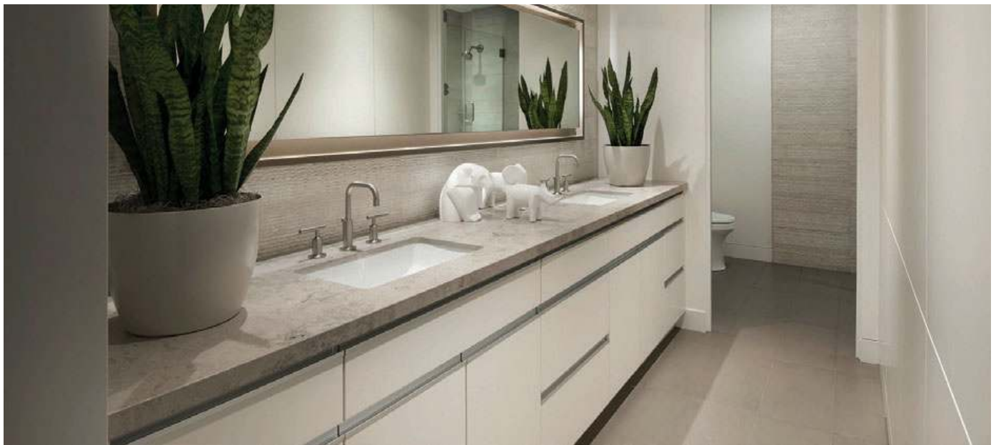
COOL NEUTRALS CRE- ATE AN AIR OF CALM IN A CONTEMPORARY BATHROOM, WITH CABINETS FROM GOODALL CUSTOM CABINETRY / TOPPED WITH CAESARSTONE COUNTERS.