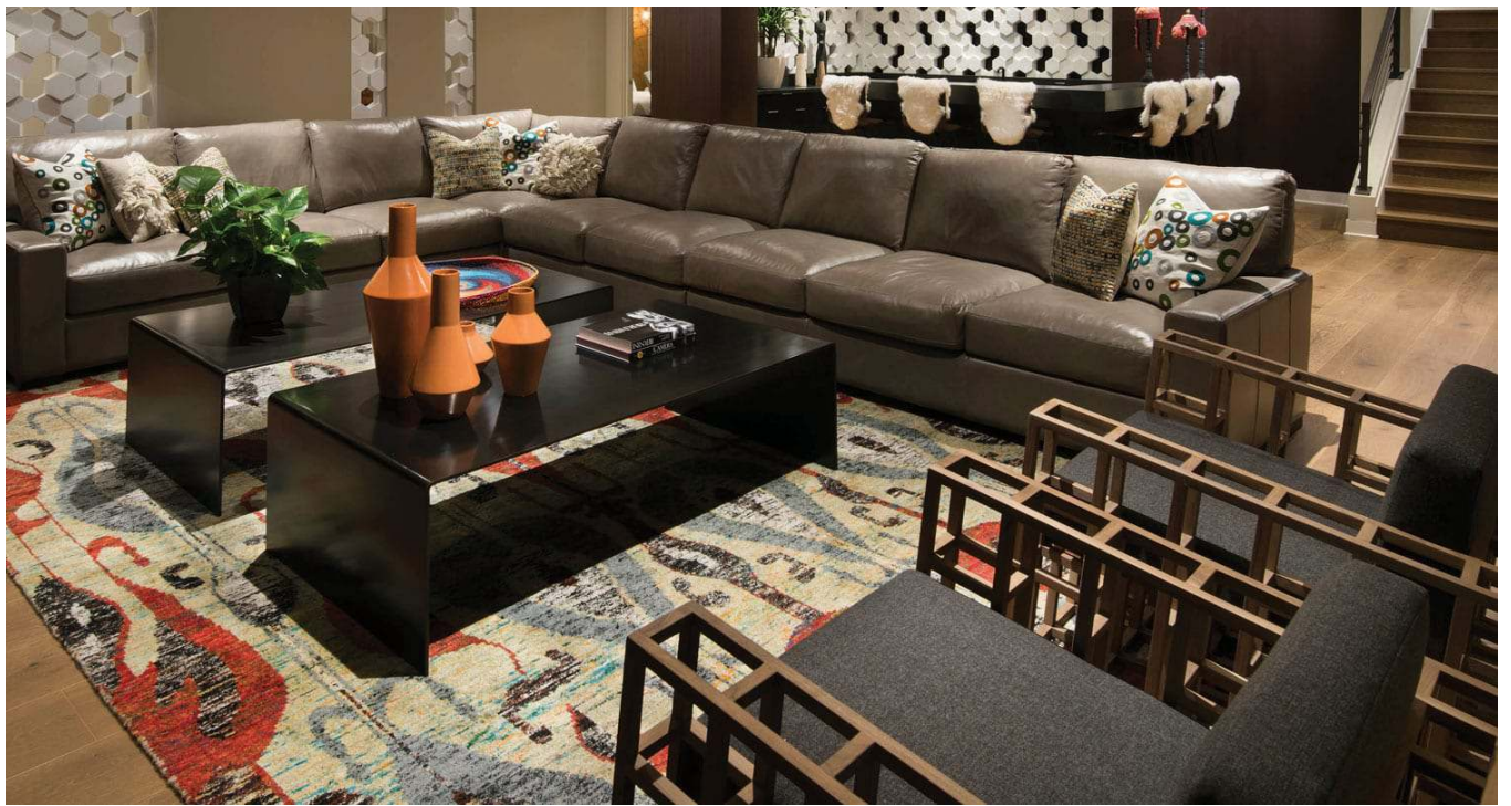
A COLORFUL LOLOI RUG UNDERFOOT INSPIRED THE DESIGN PALETTE FOR A SPACIOUS FAMILY ROOM. THE OVERSIZED SECTIONAL IS FROM LAZAR, AND THE ARMCHAIRS ARE FROM NOIR.

She advises her clients to follow their hearts when it comes to choosing art and accessories. "Buy well, and collect things that speak to you as you curate your home," she says. "Think about the overall emotion you want to feel in the space, like serenity or joy. I believe so much in the power of good design to elevate the human spirit."