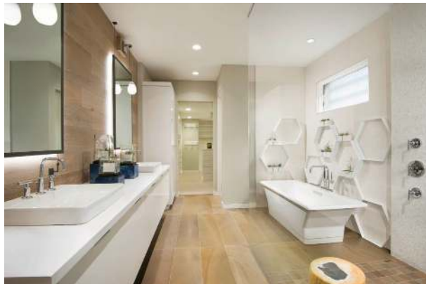
A DEEP SOAKING TUB BY KOHLER CREATES A SPA-LIKE SETTING IN A SPACIOUS BATHROOM; FIXTURES ARE ALSO BY KOHLER.

Lang also has a line of furniture, Design 528, named for the 528-hertz frequency which is said by some to be the sound of love. From clean-lined dining tables to sleek four-poster beds, each piece is functional, artistic, and ethically created from a palette of natural woods, metal, and textiles. "I'm fascinated by how things are made," Lang says. "If a quality piece is created with human hands using organic materials from nature, it resonates differently than something cheap made by machines."