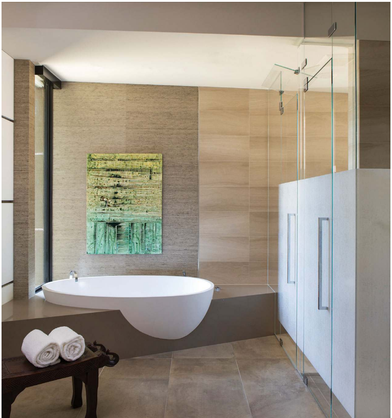
A STRIKING CLARKE BATHTUB IS OFFSET BY A PHILIP JEFFRIES WALL TREATMENT.