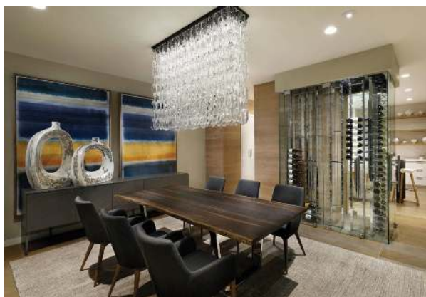
A CUSTOM CHANDELIER ILLUMINATES A NUEVO DINING TABLE AND EURØ STYLE CHAIRS.