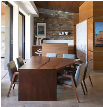
THE DINING TABLE IS BY DESIGN 528, AND THE CHAIRS ARE FROM BRIGHT CHAIR COMPANY; THE CEILING IS CLAD IN RED CEDAR.

division that creates fully furnished turnkey