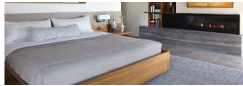
IN AN ELEGANT MASTER BEDROOM, LANG DESIGNED A SIMPLE PLATFORM BED TO REFERENCE THE LINES OF THE ARTWORKS AND FIREPLACE.

division that creates fully furnished turnkey